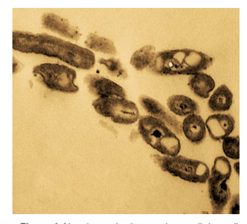
Figure 1.Alcanivorax borkumensis, an oil degrading bacteria found at the Deepwater horizon leak site, viewed under a microscope.

enzymes/chemical energy that can be used by the indigenous bacteria. Studies have shown that bioaugmented communities can degrade 60-75 % of diesel oil in only 40 days (Ramahti 2022). An example of a bacteria utilized in this way is Alcanivorax borkumensis which releases alkane hydroxylases and lipases that cleave hydrocarbons into easily consumable fragments.